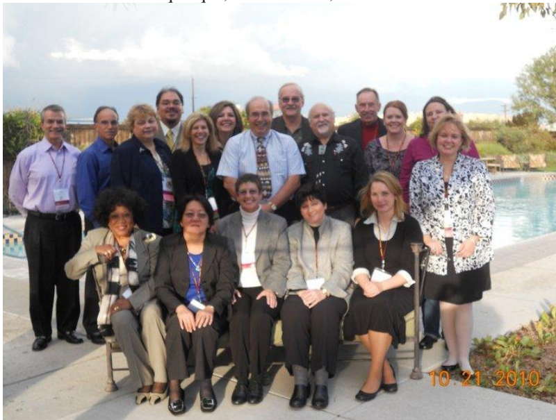
Group Photo MidAtlantic region members from the ACHE Annual Conference in Albuquerque, New Mexico, October 2010